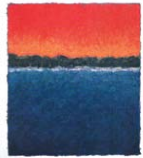
Volume 17 Number 2