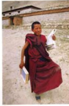
Volume 11 Number 2